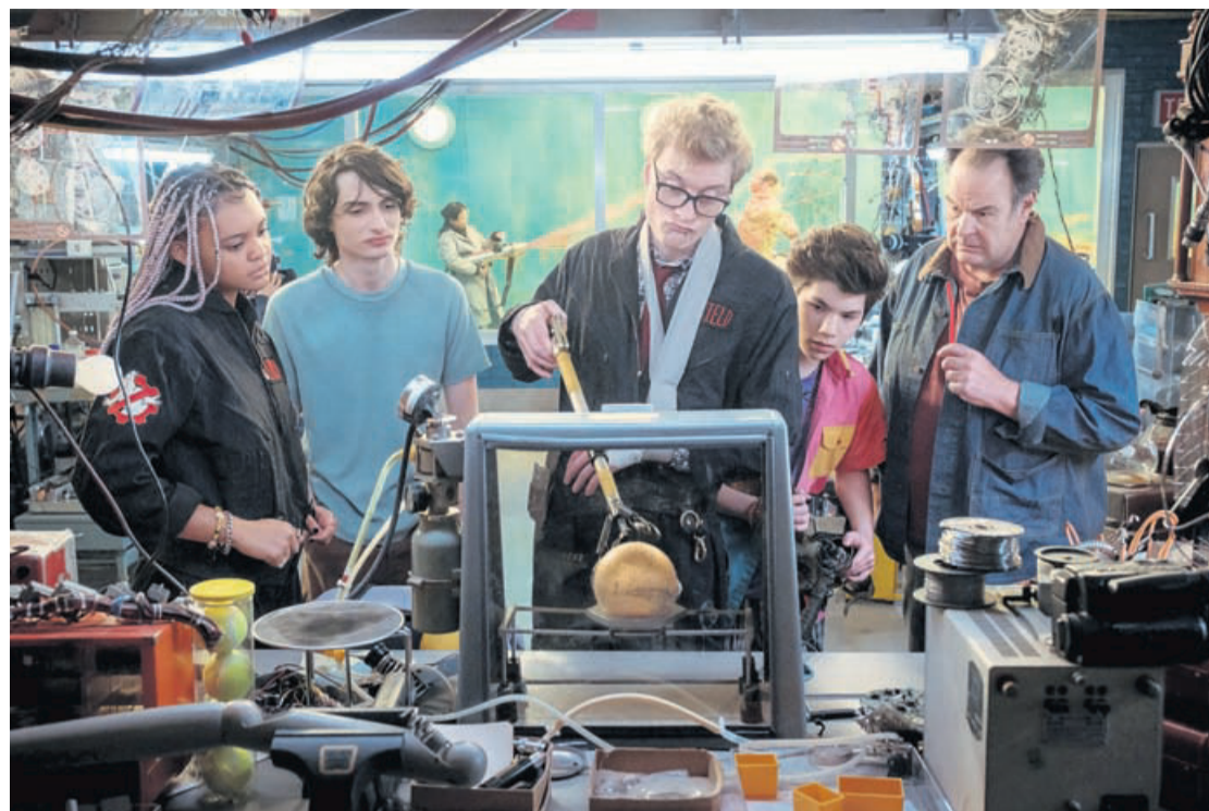
This image released by Columbia Pictures shows, from left, Celeste O'Connor, Finn Wolfhard, James Acaster, Logan Kim and Dan Aykroyd in a scene from "Ghostbusters: Frozen Empire."

Still, it's not quite as simple as that. I'm glad for the female-led 2016 "Ghostbusters." Aside from prompting a minor culture war, it assembled the best comic ensemble since the original with Melissa McCarthy, Kristen Wiig, Kate McKinnon, Leslie Jones and, yes, Chris Hemsworth. And as easy as it might be to label the new one, "Ghostbusters: Frozen Empire," another half-hashed retread which it is, a little bit it's also a significant upgrade from "Afterlife,"